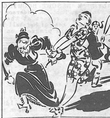
"No, no auntie, he meant take off in his plane."